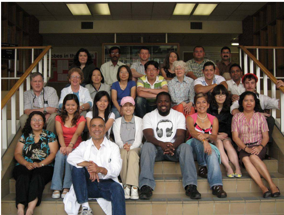
The 21 st Shrimp Pathology Short Course participants and instructors

Aquaculture in the desert? Must be puzzling to many, but shrimp aquaculture has been going on in Arizona for years. Shrimp disease research and diagnostics in the midst of sand and rocks? Even better, with no worry about contaminating waterways, farms, and culture facilities. For the past two decades, shrimp pathology enthusiasts have trooped to the Sonoran desert with one mission – to be at the Shrimp Pathology Short at the University of Arizona in Tucson. The 21 st session was held on June 1-12, 2009 with 17 participants, eight from Asia - 3 from South Korea, and one each from Taiwan, China, Saudi Arabia, Bangladesh, and Vietnam.